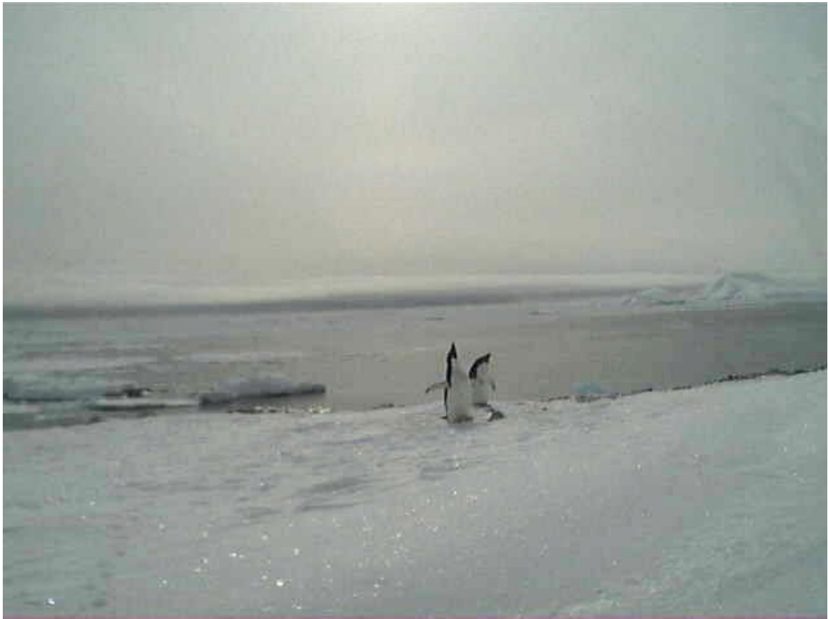
Figure 1: The first Adelie penguins arrive at the Yalour Islands, 15 th October 2014, before any vessels are able to visit them (as evidenced by the large amount of sea ice on the horizon).

The prototype satellite cameras deployed on the Yalour Islands have survived their first winter, demonstrating that the system works and that the power requirement calculations were sufficient. While mass production of the satellite camera units has been slow, these are now being delivered, so we will aim to place these on the remotest colonies in the South Sandwich Islands, Elephant Island and the South Shetland Islands in 2015/2016 to ensure that a real time network of cameras can report at times of years when the krill fishery is operating.